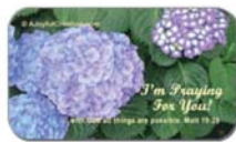
(Click on a card below to purchase.)